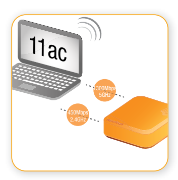
Blinding Fast 3-Stream 802.11ac